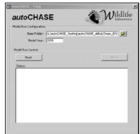
The autoCHASE user interface

In the future autoCHASE v2.0 may be released with features allowing the modeling of specific habitat scenarios and projections of habitat through time with similar ease of use.